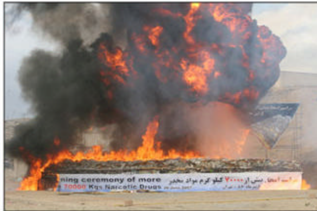
Burning of seized narcotics