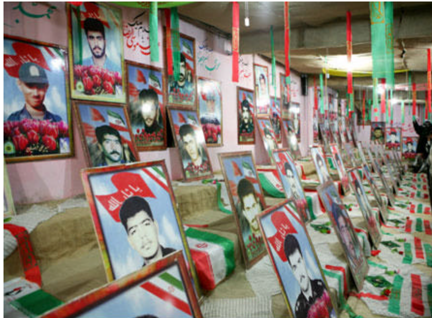
3600 martyred and 11000 disabled during the long war with the drug traffickers