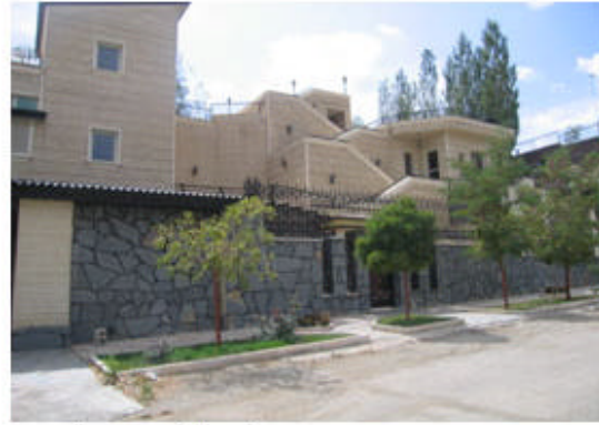
Houses earned through smuggling confiscated by the government