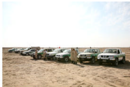
Counter drug trafficking troops stationed along borderline