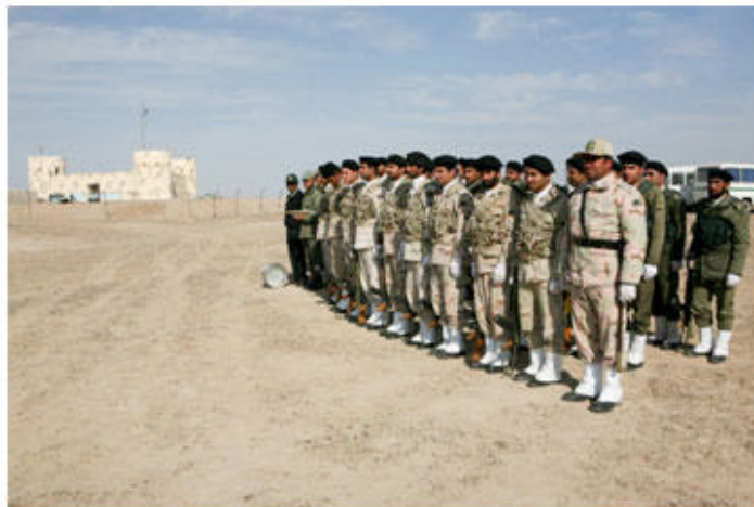
Counter Trafficking troops stationed at Rasoule-e-Akram base

Rasoul-e-Akram base became operational in 2006. The base seeks to act as a coordinating body in measures along the eastern borders particularly the province of Sistan & Baluchistan. More than 50000 forces are present at the base so as to pave the way for swift and effective operations against drug traffickers.