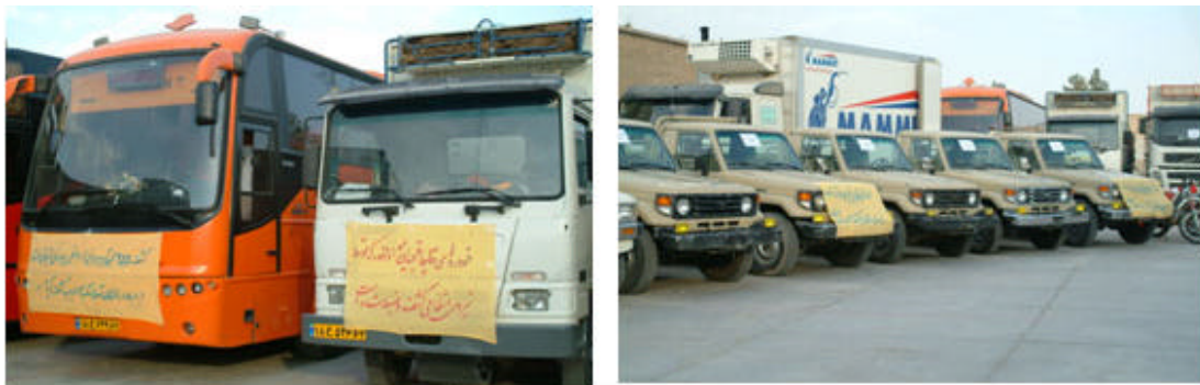
Smugglers vehicles confiscated by the government

Article 29 of the Anti-Narcotics Act also reiterates that the fines and other funds received through the enforcement of this act shall be imbued into a centralized account that will be opened with the Ministry of Economic Affairs and Finance. In order to fulfill the goals set by the national plan for the campaign against narcotic drugs, the Government includes the required credits for the implementation of programs approved by the Headquarters within the country's annual budget.