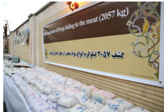
2057 kg of drugs seized in the course of an operation