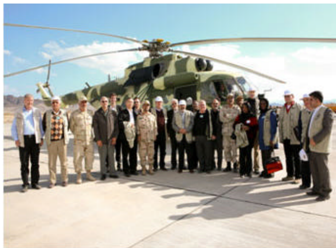
Mini Dublin ambassadors visiting Iran -Afghanistan border

A number of ambassadors, the INCB secretary and the UNODC representative in Tehran along with 21 domestic and foreign journalists visited the eastern border areas on November 29, 2008 in order to make other countries familiar with the anti-drug efforts of the Islamic Republic of Iran. The delegation initially visited Rasoul-e-Akram base in the city of Zahedan and held talks with relevant authorities. Later, they visited an exhibition and Tasuki border point and learned about different activities by the Iranian forces in the fields of operation, intelligence, engineering, equipment, etc.