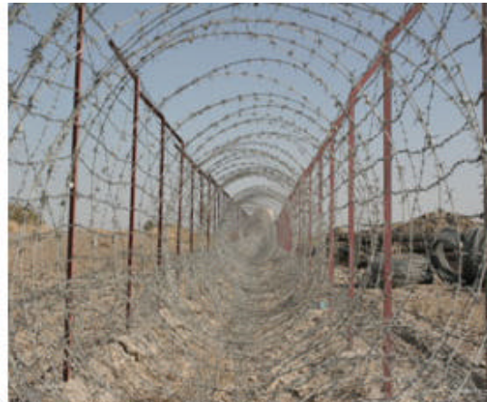
Construction of concrete walls and barbed fences along Iran- Afghanistan border