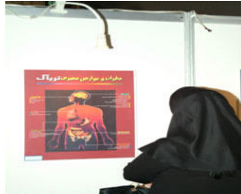
Parents are other addressors of preventive-demand reduction programs