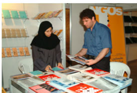
Educational journals and pamphlets