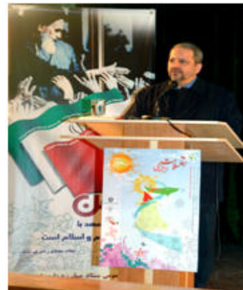
"Woman and promotion of social health" seminar