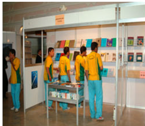
Students visiting a prevention-demand reduction festival